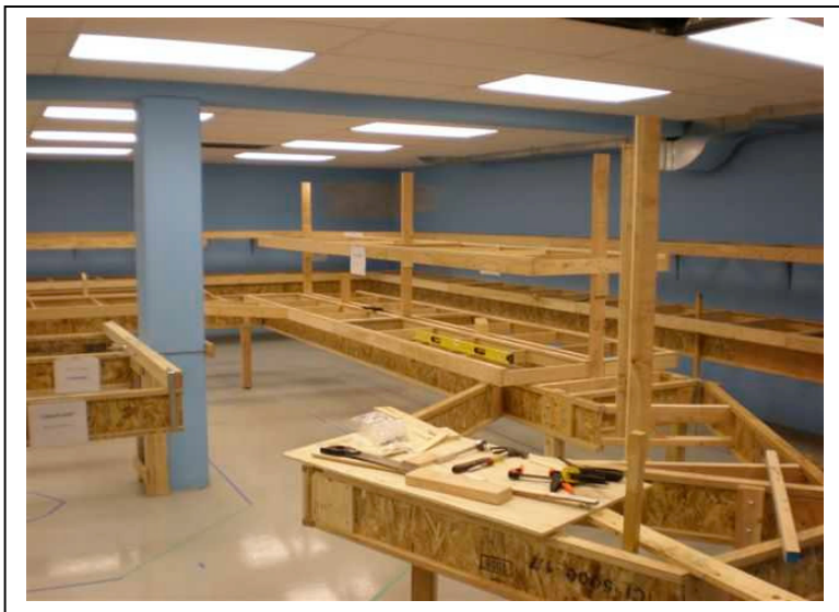
Below is benchwork in the northwest corner section where the helix will be located.